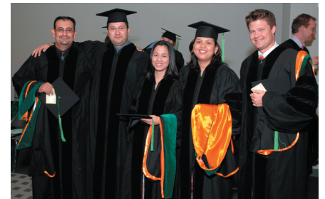
Graduates gather for a group shot in the "Robing Room" at Commencement.