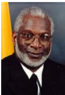
Dr. David Satcher

Reminder: Dr. David Satcher , Surgeon General of the United States, will be speaking tomorrow, Saturday, Nov. 7 , 1 p.m., at the Cullen Auditorium, Baylor College of Medicine. For more information call (713) 665-8108 .